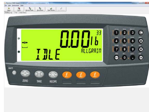
VIEW 400 SCREENSHOT

THE JEM-423-BAT DIGITAL CONTROLLER IS AVAILABLE IN 4 MODELS: